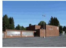
St. Marys Catholic Elementary