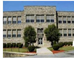
St. Marys Catholic Middle School

The Elk County Catholic School System (ECCSS) was incorporated in November, 2010. The system is a product of merging three Catholic schools in St. Marys, Pennsylvania: St. Marys Catholic Elementary School, St. Marys Catholic Middle School, and Elk County Catholic High School. All three schools are accredited by the Middle States Association of Colleges and Schools.