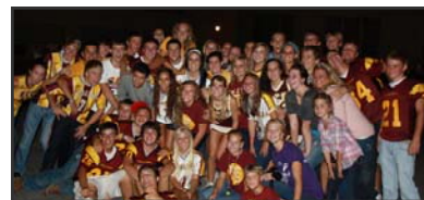
H.S. Juniors and Seniors