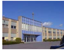
Elk County Catholic HS