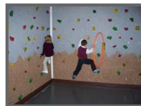
The Climbing Wall