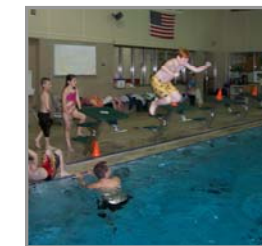
Swimming lessons at the YMCA