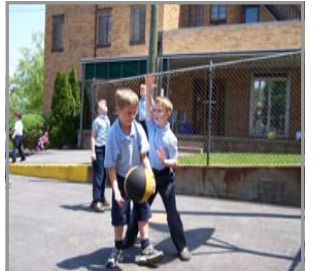
Playing hard at recess