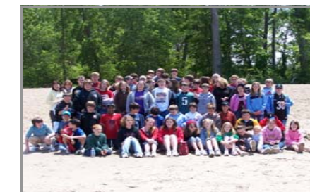
SSS Middle School visits Tom Ridges Environmental Center in Erie.